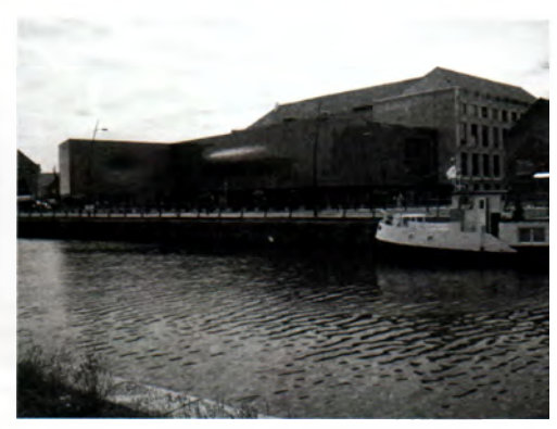
The museum from the canal

The entire day disappeared in a blur of speeches, an amazing building, machinery, incredible exhibitions, a truly French cat-