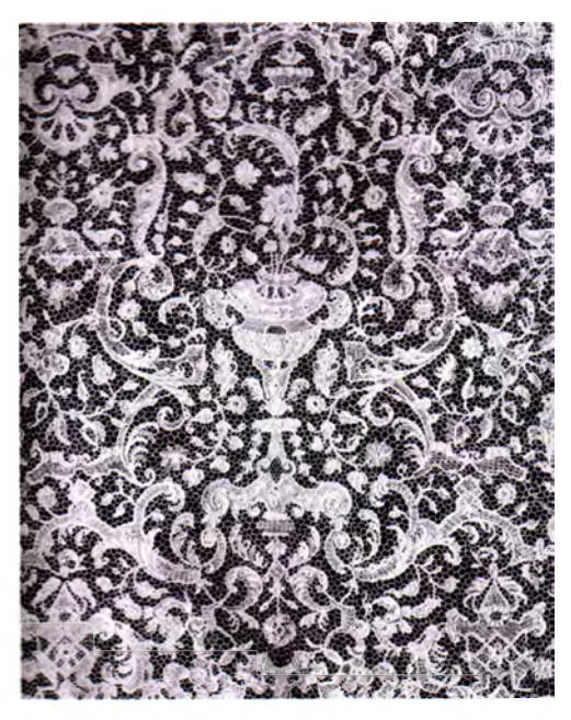
The Journal of the Australian Society of the Lacemakers of Calais Inc.

Volume 27, No 3, Aug 2009 (Issue 104) ISSN 0815 - 3442